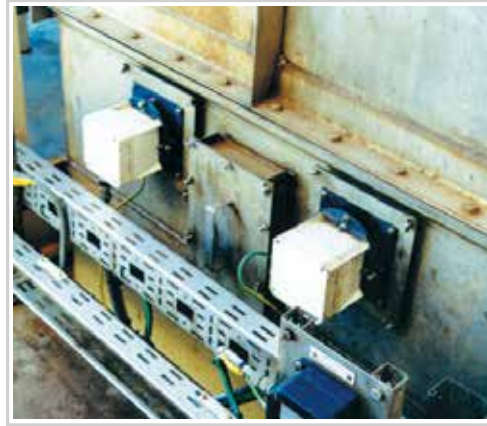
Air Duct Installation on ETAP Platform in the North Sea

The kit includes an Alignment Telescope P/N 794110, a Magnetic Mode Selector P/N 790285 and a Function Check Filter P/N 794220-1÷5 for system testing along with socket keys for access to units (P/N 792247).